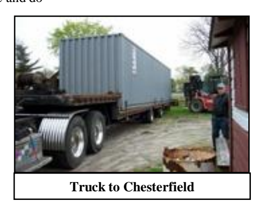
7000 Pounds of Layout