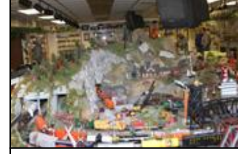
14 foot by 40 foot layout

Future plans are to bring the Riverhead building interior renovation up to code and then to install the layout. We are looking to have this accomplished by the summer of 2010. The critical path for this plan is to raise funds for the interior building materials.