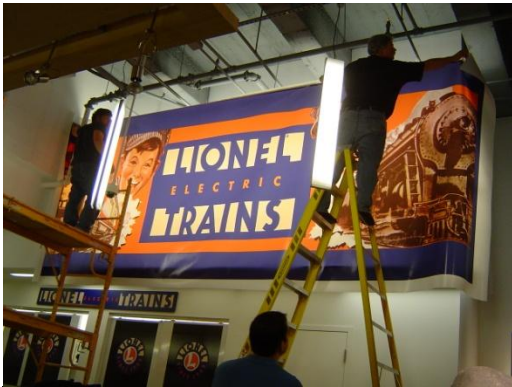
Hey, wait a minute, the banner is too long. That's OK, it's nothing that a sharp utility knife can't fix. Nobody will ever know. It turned out PERFECT.