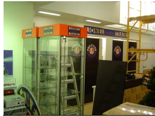
Empty display cases soon to be filled with goodies.