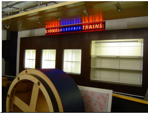
Lionel Electric Trains in NEON. WOW!!!