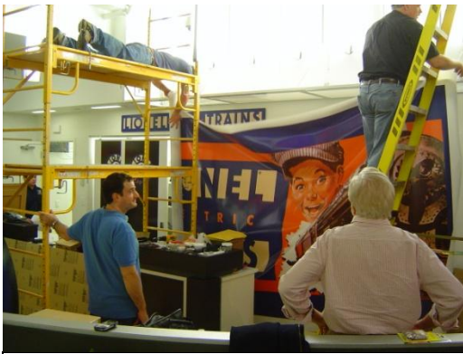
The large banner begins to unroll. What excitement.