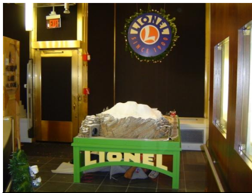
When the store opened, these large windows allowed passers-by to see the operating layout in the window. Who is that guy under the layout? See the Sidebar later in the article.