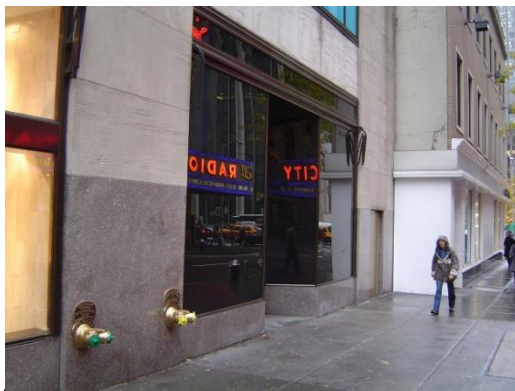
The view of the outside of the Lionel Store. There is no indication of the magic that this happening inside. Note the reflection in the windows of Radio City Music Hall which is right across the street.

As they say, a picture is worth a thousand words, so instead of trying to describe how the store was created, I've compiled this photo-essay that should tell the story. ENJOY!!!