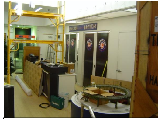
The cash register area was a temporary workbench.