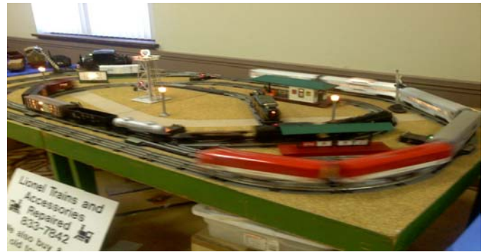
Dave Decker's original Lionel display layout