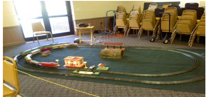
This standard gauge has been seen at METCA shows