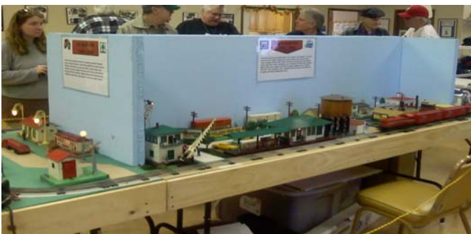
Jim Reid's multi-era display