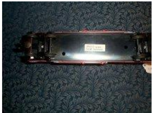
Paper label-"SPECIAL METCA Color Reversed"- looks like it was done on a typewriter!

Joe also supplied a Spreadsheet with approximately thirteen '76 METCA Club Cars with some variations. He does have cars with the correct "TCA" in black and "METCA Division" and "1976" in yellow, but a few without any rubber stamping information on the chassis at all! One of the variations was bought in York in 2005 and the other on eBay in 2005.