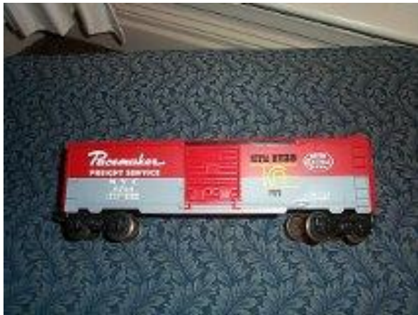
"Reversed Lettering" - Yellow "TCA" and black "METCA Division" and "1976"