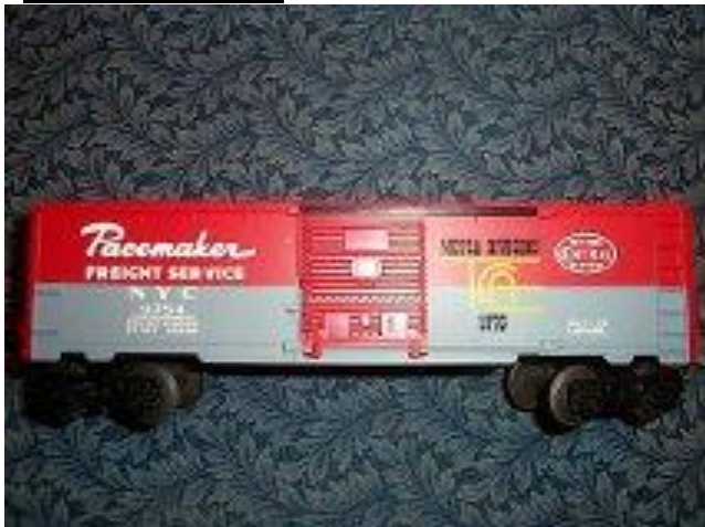
"Reversed Lettering" - Yellow "TCA" and black "METCA Division" and "1976"