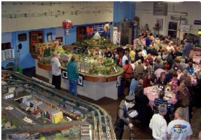
The view from the control tower as the METCA door prizes are disbursed