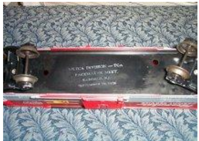
Rubber stamped Club information on car chassis