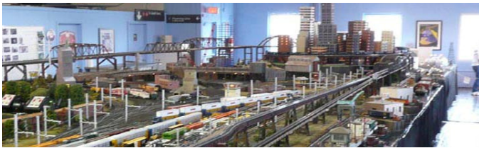
The largest 3-rail layout in the US

For members like me, who had never had the pleasure of visiting the NJ Hi-Railers enormous facility, the hour was barely enough to explore their amazing series of layouts.